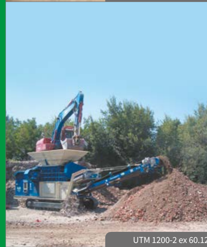
UTM 1200-2 ex 60.12