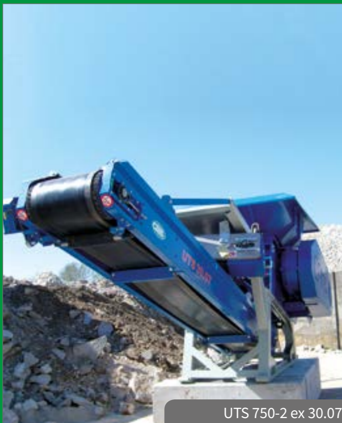
UTS 750-2 ex 30.07