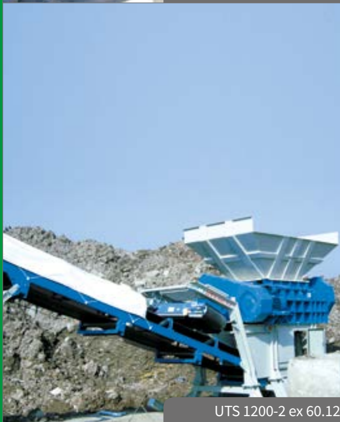
UTS 1200-2 ex 60.12