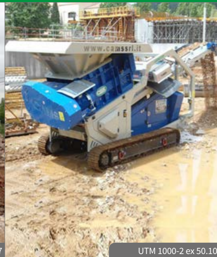
UTM 1000-2 ex 50.10