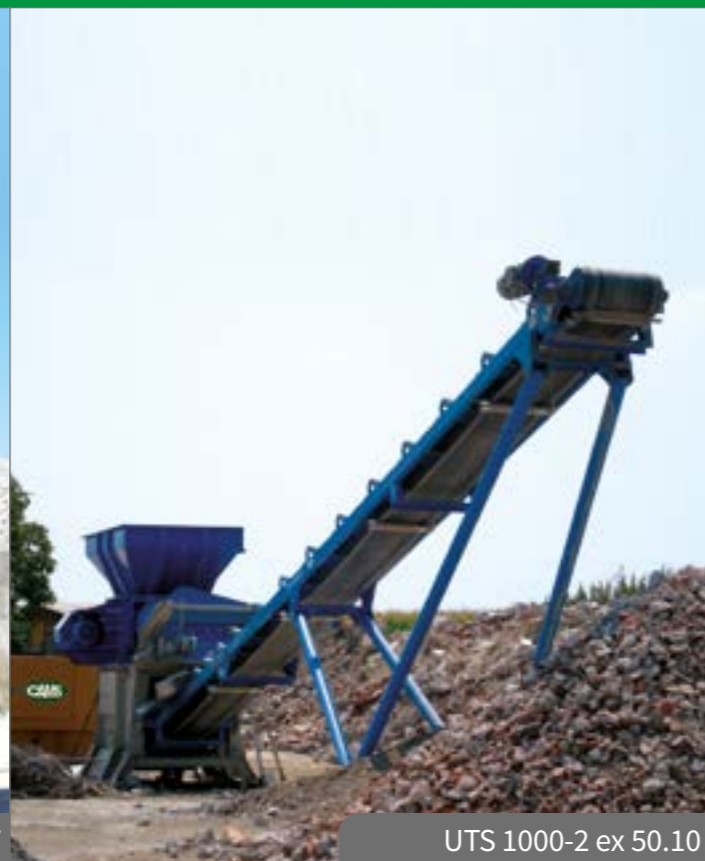
UTS 1000-2 ex 50.10