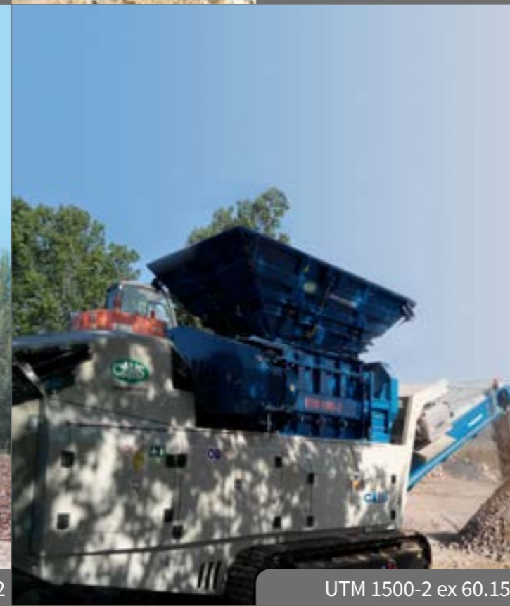
UTM 1500-2 ex 60.15