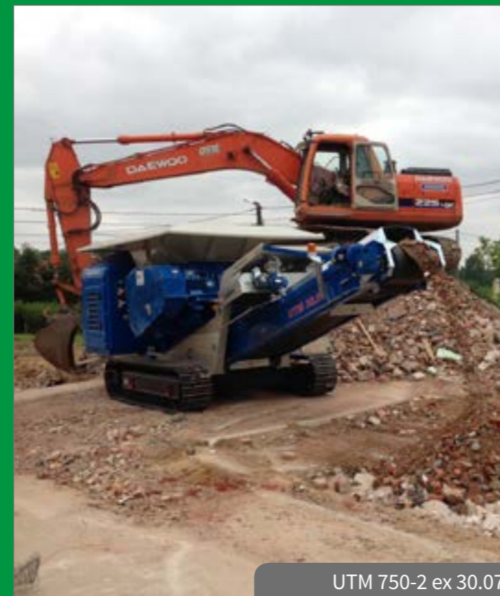
UTM 750-2 ex 30.07