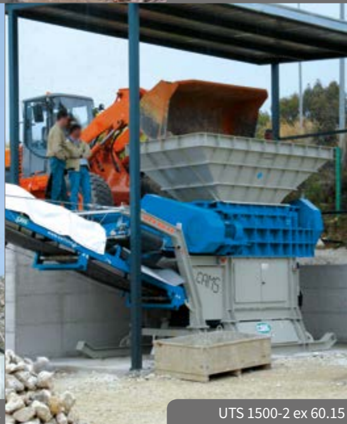
UTS 1500-2 ex 60.15